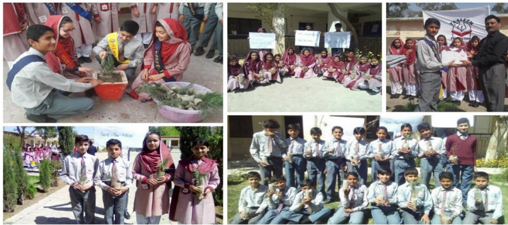
FIGURE 6 PLANTATION DAY