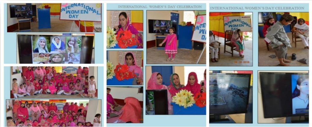
FIGURE 4 INTERNATIONAL WOMEN DAY