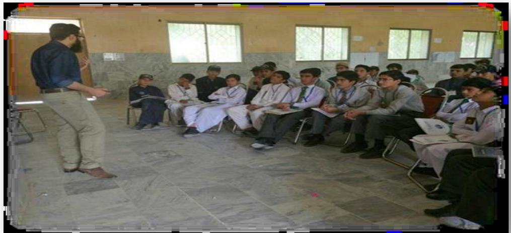
FIGURE 2 AFAQ TARBIYAH SCHOLARSHIP CAMP