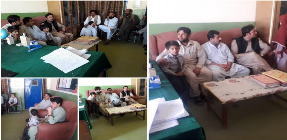
FIGURE 3 PARENT TEACHING MEETINGS