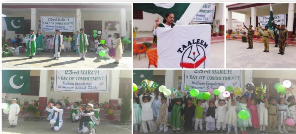
FIGURE 5 PAKISTAN RESOLUTION DAY