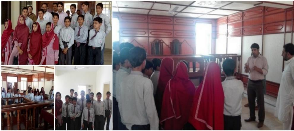
FIGURE 1 EDUCATIONAL TRIP