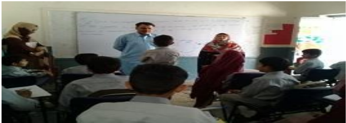
FIGURE 11 VISIT OF DEO AND ADO MASTUNG