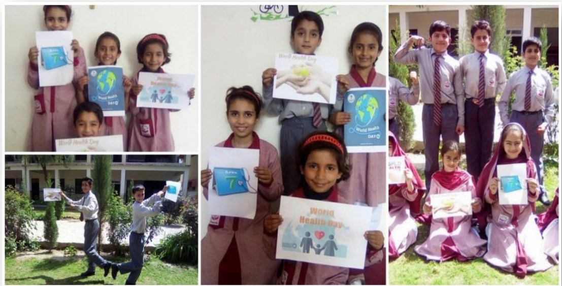
FIGURE 7 WORLD HEALTH DAY