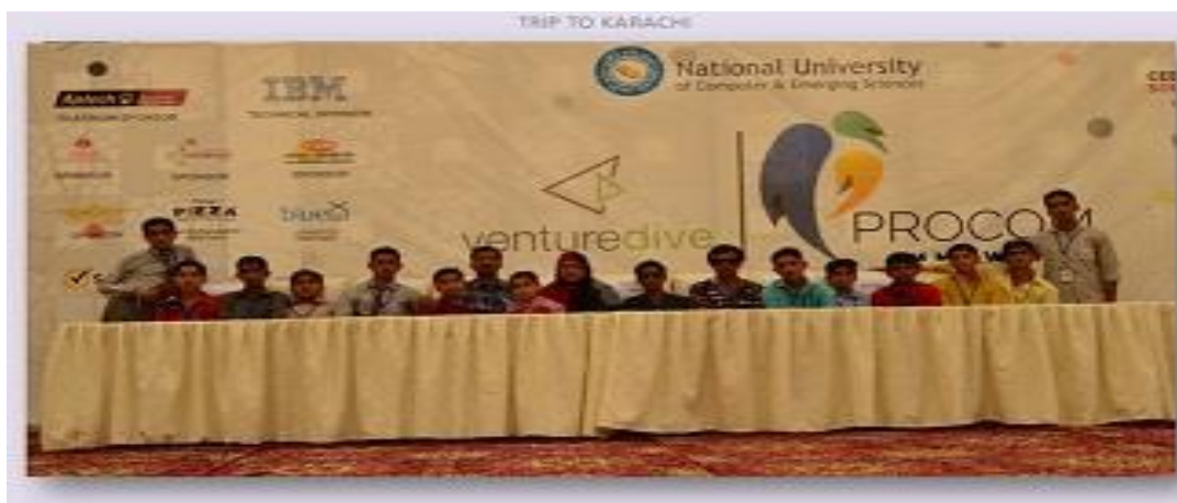
FIGURE 12 PARTICIPATION IN PROCOM-18