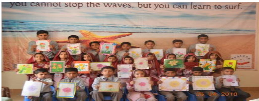
FIGURE 10 ART AND WRITING COMPETITION