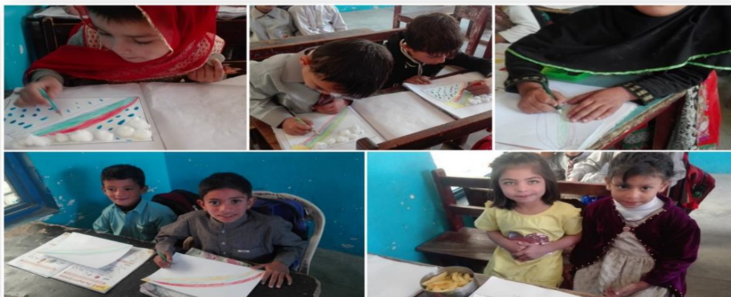
FIGURE 8 COLOR DAY