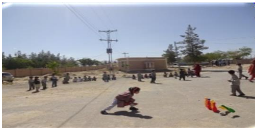
FIGURE 9 SPORTS GALA