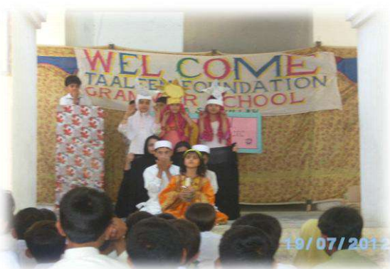
Annual Prize Distribution Function