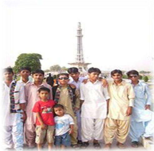
Trip to Lahore