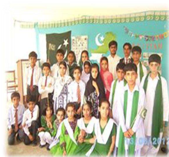
Sports Week Independence Day