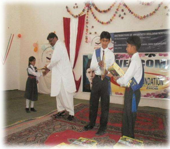
Distribution of Gogi comics