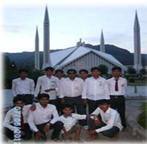
Trip to Islamabad