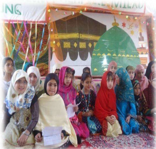
Eid Milad -un-Nabi