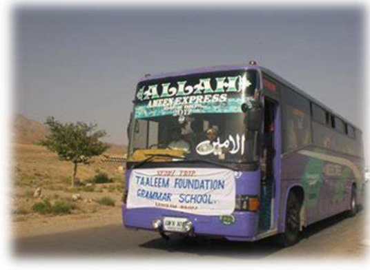
Trip to Ziarat