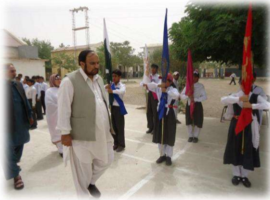
Independence Day celebrations