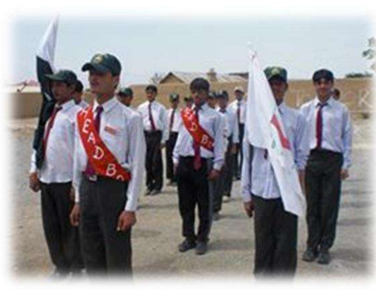
Prize Distribution Function