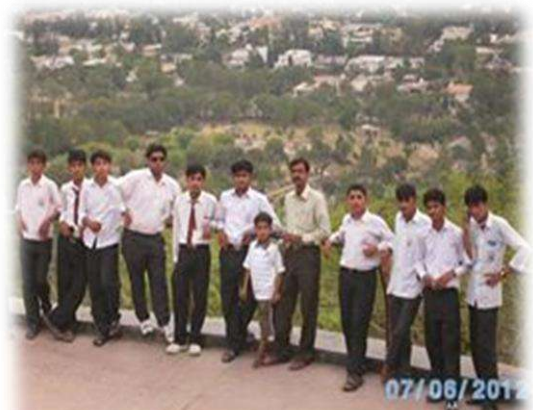
Trip to Murree