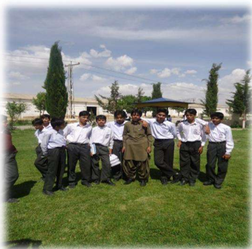
Trip to Quetta