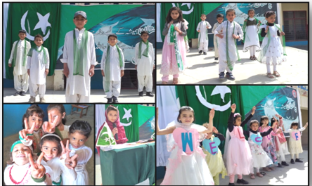
Figure 1: Pakistan Resolution Day Celebrations at TFGS Pishin

TF Grammar Schools celebrated Pakistan Resolution Day on 23rd March, 2019. Pishin and Kohlu schools celebrated national day with full enthusiasm. Honorable DC Pishin Mr. Aurangzeb Badini was Chief Guest at Pishin School. D.C kohlu Mr.Munawar and Provincial health Minister were special guests at Kohlu School. School's authorities & Students paid tribute to the National heroes of Pakistan for their untiring efforts to gift us this beautiful homeland. National anthem with flag raising ceremony, patriotic fervor & other celebrations like essay competition, art, speeches & skits were part of this event.