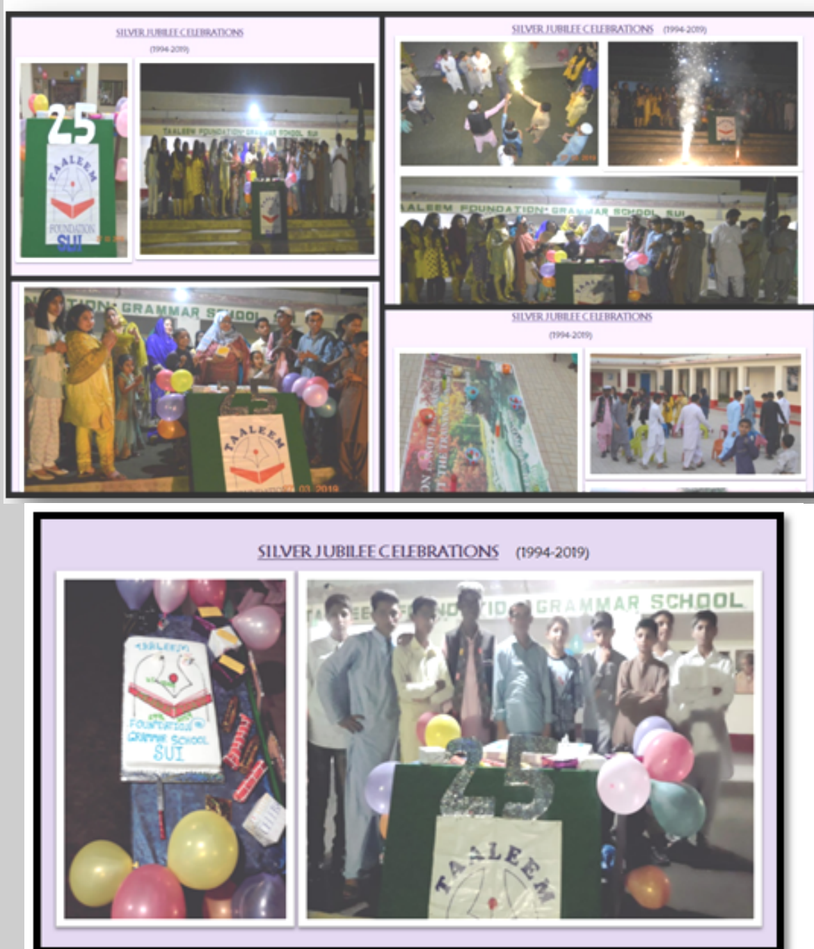
Figure 3 Silver Jubilee Celebrations

The celebrations included success party for top achievers and staff members. Some games like musical chair, pick a ball blindfolded, pick brushes with cap shades, etc were played for amusement. Students enjoyed the firework display and were amused by crackers. Game winners received small gifts and the dinner was served. The Last part of the celebration party was cake cutting ceremony.