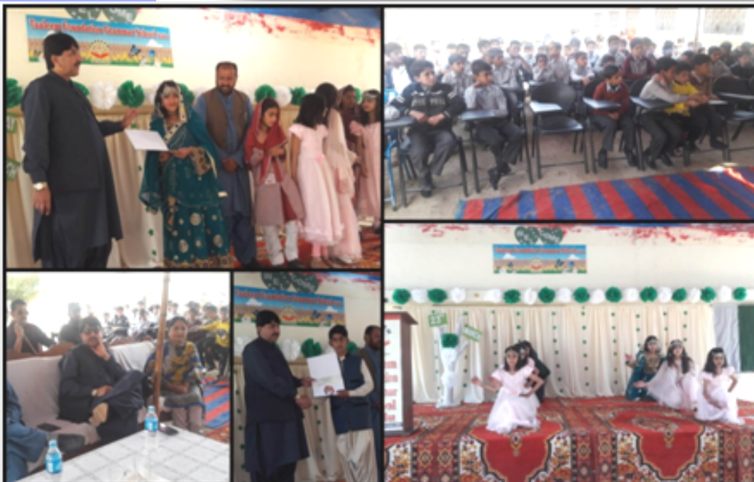
Figure 2: Pakistan Resolution Day Celebrations at TFGS Kohlu